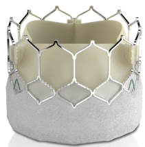
SAPIEN 3 Ultra valve

The lifetime management of your TAVR patients is of increasing importance. Now with an indication for aortic THV-in-THV procedures, the SAPIEN 3 Ultra valve can be used to treat these patients not only today, but also in the future.